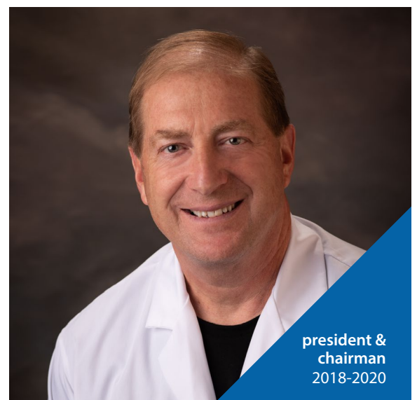
president & chairman 2018-2020

We are grateful for your dedication and leadership over the past two years!